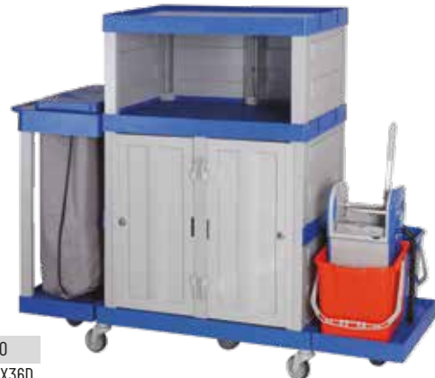
ART NO HLM 500 EX36D

3 X Strong Shelves With 90kg Loading capacity, 100mm Wheels With Double bearing, 120L Poly Bag With Zip, 2 Doors, 2x25l Double Bucket Trolley with Down Press Wringer, ergonomic Push Handle With Groove.