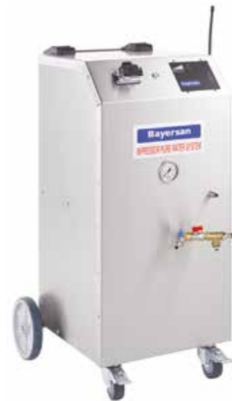
ART NO CPDI2353