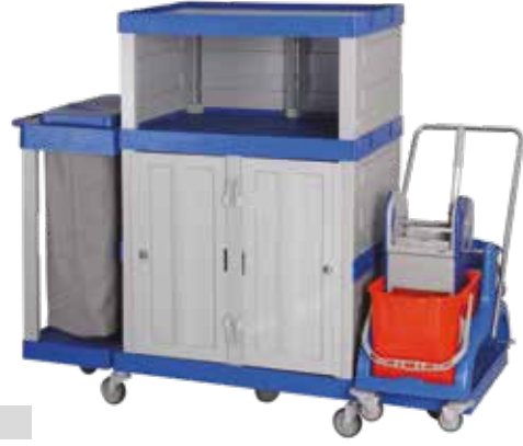
ART NO HLM 500 SCPD

3 X Strong Shelves With 90kg Loading Capacity, 100mm Wheels With Double Bearing, 120L Poly Bag With Zip, 2 Doors, complete 2x25l Moveable Double bucket Trolley With Downpress Wringer, Ergonomic Pushhandle With Groove.