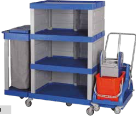
ART NO HLM 500 SCP

3 X Strong Shelves With 90kg Loading Capacity, 100mm Wheels With Double Bearing, 120L Poly Bag With Zip, Complete 2x25l Moveable Double Bucket Trolley With Downpress Wringer, Ergonomic Push Handle With Groove.