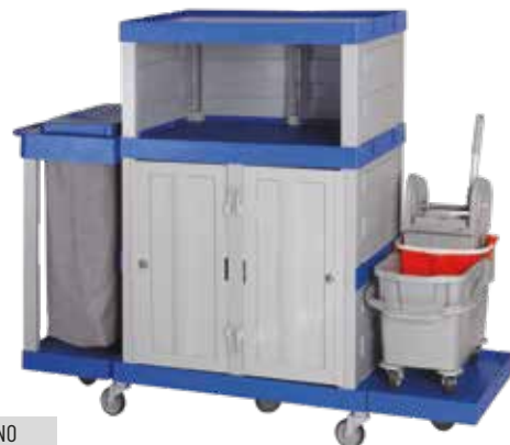
ART NO HLM 500 STE25D

3 x strong shelves with 90kg loading capacity, 100mm wheels with double bearing, 120L poly bag with zip, 2 doors, 25L Ergo Double Bucket Trolley with downpress wringer, ergonomic pushhandle with groove.