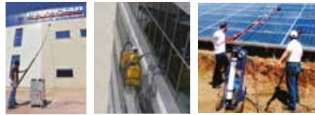
ART NO CMSE2351