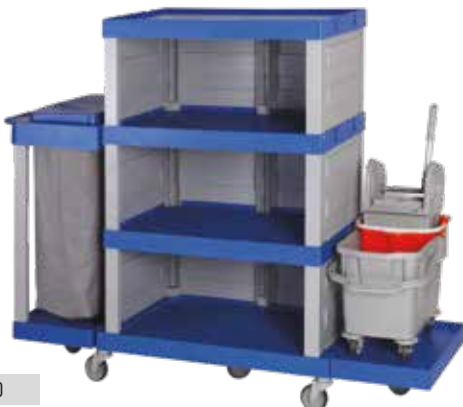
ART NO HLM 500 STE25

3 X Strong Shelves With 90kg Loading Capacity, 100mm Wheels With Double Bearing, 120L Poly Bag With Zip, 25l Ergo double Bucket Trolley With Downpress Wringer, Ergonomic Pushhandle With Groove.