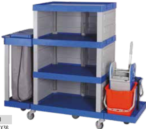
ART NO HLM 500 EX36

3 X Strong Shelves With 90kg Loading capacity, 100mm Wheels With Double bearing, 120L Poly Bag With Zip, 2x25l Double Bucket Trolley With Down Press Wringer, Ergonomic Pushhandle With Groove.