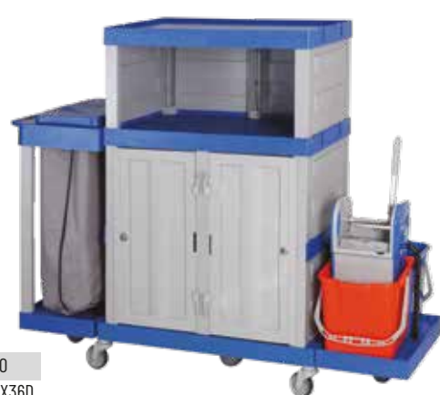
ART NO HLM 500 EX36D

3 X Strong Shelves With 90kg Loading capacity, 100mm Wheels With Double bearing, 120l Poly Bag With Zip, 2 Doors, 2x25l Double Bucket Trolley with Down Press Wringer, ergonomic Push Handle With Groove.